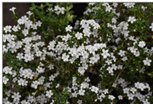
Variegated Serissa flowers

This is a dense multi-stemmed evergreen houseplant with an upright spreading habit of growth. Its extremely fine and delicate texture is quite ornamental and should be used to full effect. This plant may benefit from an occasional pruning to look its best.