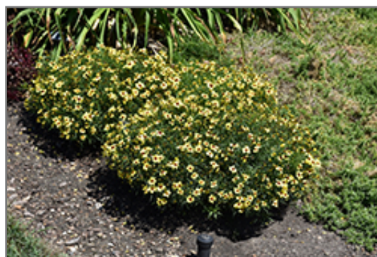
Sizzle And Spice Sassy Saffron Tickseed in bloom