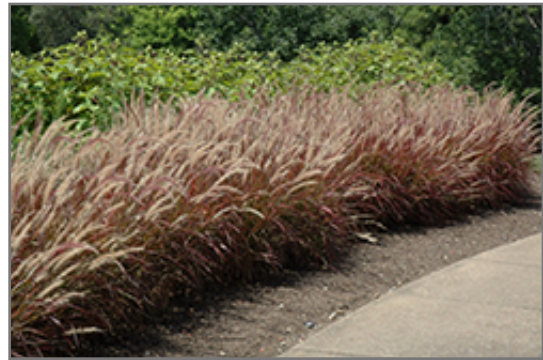
Purple Fountain Grass in bloom

Purple Fountain Grass will grow to be about 4 feet tall at maturity, with a spread of 3 feet. Although it's not a true annual, this plant can be expected to behave as an annual in our climate if left outdoors over the winter, usually needing replacement the following year. As such, gardeners should take into consideration that it will perform differently than it would in its native habitat.