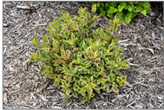
Rainbow Sensation Weigela

Rainbow Sensation Weigela makes a fine choice for the outdoor landscape, but it is also well-suited for use in outdoor pots and containers. Because of its height, it is often used as a 'thriller' in the 'spiller-thriller-filler' container combination; plant it near the center of the pot, surrounded by smaller plants and those that spill over the edges. It is even sizeable enough that it can be grown alone in a suitable container. Note that when grown in a container, it may not perform exactly as indicated on the tag - this is to be expected. Also note that when growing plants in outdoor containers and baskets, they may require more frequent waterings than they would in the yard or garden.