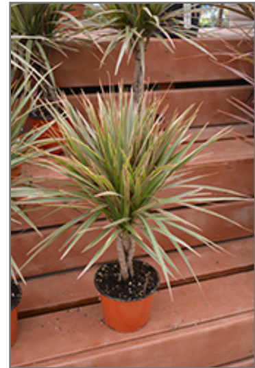
Colorama Dracaena in full

When grown indoors, Colorama Dracaena can be expected to grow to be about 3 feet tall at maturity, with a spread of 24 inches. It grows at a medium rate, and under ideal conditions can be expected to live for approximately 10 years. This houseplant performs well in both bright or indirect sunlight and strong artificial light, and can therefore be situated in almost any well-lit room or location. It does best in average to evenly moist soil, but will not tolerate standing water. The surface of the soil shouldn't be allowed to dry out completely, and so you should expect to water this plant once and possibly even twice each week. Be aware that your particular watering schedule may vary depending on its location in the room, the pot size, plant size and other conditions; if in doubt, ask one of our experts in the store for advice. It is not particular as to soil type or pH; an average potting soil should work just fine.