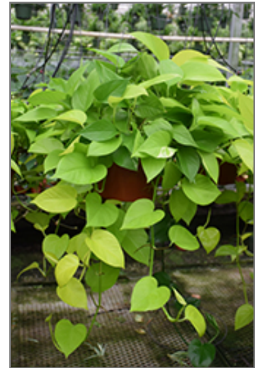
Neon Pothos in full

When grown indoors, Neon Pothos can be expected to grow to be about 5 feet tall at maturity, with a spread of 24 inches. It grows at a fast rate, and under ideal conditions can be expected to live for approximately 10 years. This houseplant performs well in both bright or indirect sunlight and strong artificial light, and can therefore be situated in almost any well-lit room or location. It does best in average to evenly moist soil, but will not tolerate standing water. The surface of the soil shouldn't be allowed to dry out completely, and so you should expect to water this plant once and possibly even twice each week. Be aware that your particular watering schedule may vary depending on its location in the room, the pot size, plant size and other conditions; if in doubt, ask one of our experts in the store for advice. It is not particular as to soil type or pH; an average potting soil should work just fine. Be warned that parts of this plant are known to be toxic to humans and animals, so special care should be exercised if growing it around children and pets.