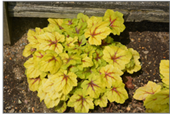
Catching Fire Foamy Bells

This is a relatively low maintenance plant, and should be cut back in late fall in preparation for winter. It is a good choice for attracting hummingbirds to your yard. It has no significant negative characteristics.