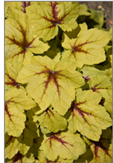
Catching Fire Foamy Bells foliage