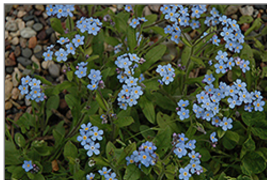
Forget-Me-Not flowers