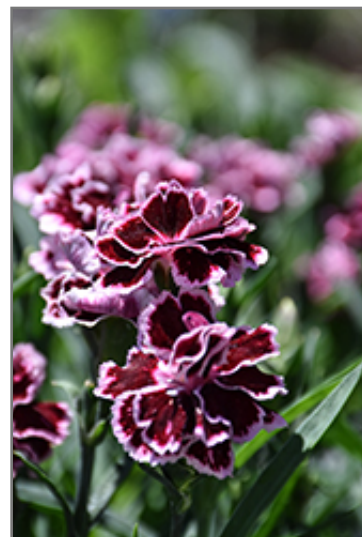
Odessa Pierrot Pinks flowers

Odessa Pierrot Pinks is recommended for the following landscape applications;