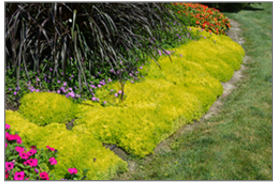
Lemon Coral Stonecrop

Lemon Coral Stonecrop will grow to be about 8 inches tall at maturity, with a spread of 12 inches. When grown in masses or used as a bedding plant, individual plants should be spaced approximately 10 inches apart. Its foliage tends to remain low and dense right to the ground. It grows at a fast rate, and under ideal conditions can be expected to live for approximately 10 years. As an herbaceous perennial, this plant will usually die back to the crown each winter, and will regrow from the base each spring. Be careful not to disturb the crown in late winter when it may not be readily seen!