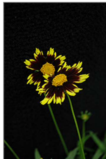
Cosmic Eye Tickseed flowers

Cosmic Eye Tickseed is recommended for the following landscape applications;