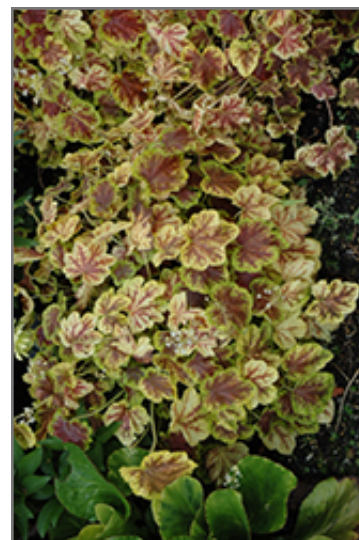
Solar Eclipse Foamy Bells