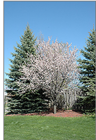
Newport Plum in bloom

This tree should only be grown in full sunlight. It does best in average to evenly moist conditions, but will not tolerate standing water. It is not particular as to soil type or pH. It is highly tolerant of urban pollution and will even thrive in inner city environments. This is a selected variety of a species not originally from North America.