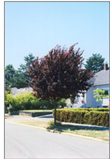
Newport Plum