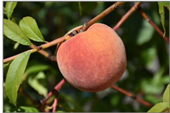
Redhaven Peach fruit

Redhaven Peach is covered in stunning clusters of fragrant pink flowers along the branches in early spring, which emerge from distinctive rose flower buds before the leaves. It has dark green deciduous foliage. The narrow leaves turn yellow in fall. The fruits are showy yellow drupes with a red blush, which are carried in abundance in mid summer. The fruit can be messy if allowed to drop on the lawn or walkways, and may require occasional clean-up.