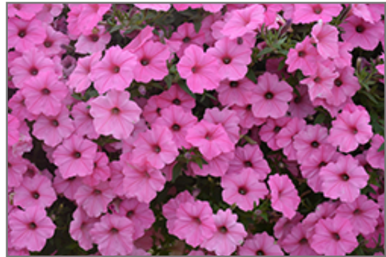
Supertunia Vista Bubblegum Petunia flowers