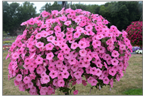
Supertunia Vista Bubblegum Petunia in bloom

Supertunia Vista Bubblegum Petunia is a fine choice for the garden, but it is also a good selection for planting in outdoor containers and hanging baskets. Because of its trailing habit of growth, it is ideally suited for use as a 'spiller' in the 'spiller-thriller-filler' container combination; plant it near the edges where it can spill gracefully over the pot. Note that when growing plants in outdoor containers and baskets, they may require more frequent waterings than they would in the yard or garden.