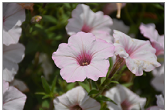
Supertunia Vista Silverberry Petunia flowers