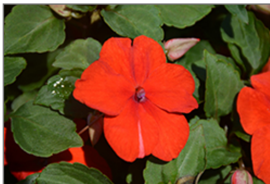
Super Elfin XP Scarlet Impatiens flowers

Super Elfin XP Scarlet Impatiens is recommended for the following landscape applications;