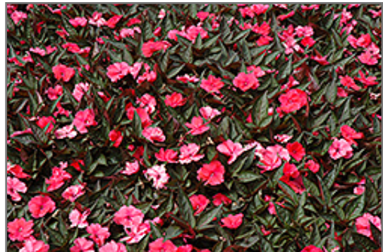
SunPatens Compact Deep Rose New Guinea Impatiens in bloom