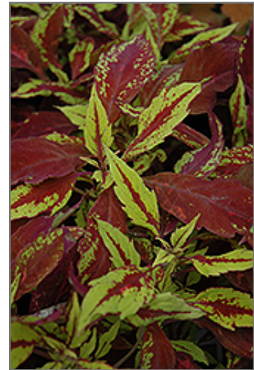
Pineapple Coleus foliage