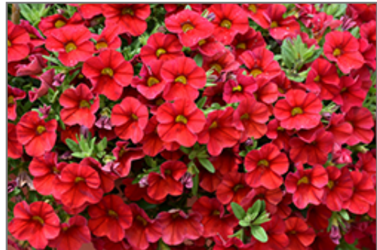
Superbells Red Calibrachoa flowers

Superbells Red Calibrachoa is recommended for the following landscape applications;