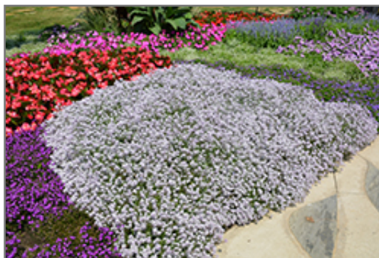
Blushing Princess Sweet Alyssum in bloom

Blushing Princess Sweet Alyssum will grow to be only 6 inches tall at maturity, with a spread of 24 inches. When grown in masses or used as a bedding plant, individual plants should be spaced approximately 20 inches apart. Its foliage tends to remain low and dense right to the ground. This fast-growing annual will normally live for one full growing season, needing replacement the following year.