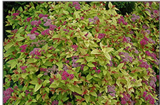
Magic Carpet Spirea flowers