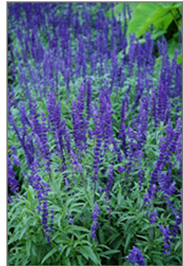
Victoria Blue Salvia flowers

Victoria Blue Salvia is a fine choice for the garden, but it is also a good selection for planting in outdoor pots and containers. With its upright habit of growth, it is best suited for use as a 'thriller' in the 'spiller-thriller-filler' container combination; plant it near the center of the pot, surrounded by smaller plants and those that spill over the edges. Note that when growing plants in outdoor containers and baskets, they may require more frequent waterings than they would in the yard or garden.