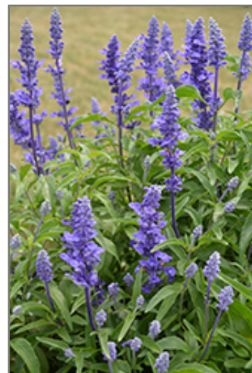
Victoria Blue Salvia flowers

Victoria Blue Salvia is recommended for the following landscape applications;