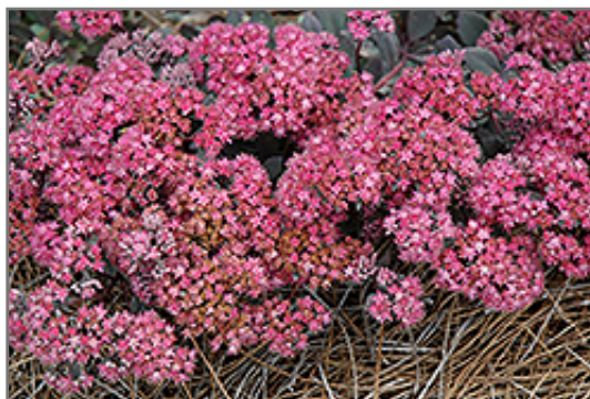
Dazzleberry Stonecrop flowers

Dazzleberry Stonecrop is a dense herbaceous perennial with an upright spreading habit of growth. Its medium texture blends into the garden, but can always be balanced by a couple of finer or coarser plants for an effective composition.