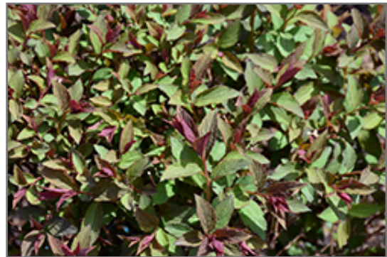
Double Play Artisan Spirea foliage