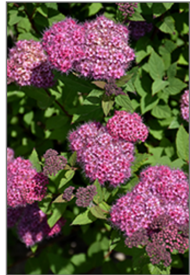
Double Play Artisan Spirea flowers

Double Play Artisan Spirea is recommended for the following landscape applications;