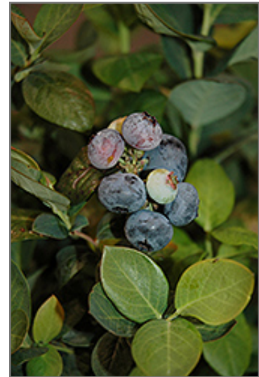
Peach Sorbet Blueberry fruit

Peach Sorbet Blueberry features dainty clusters of white bell-shaped flowers hanging below the branches in mid spring. It has green evergreen foliage. The glossy oval leaves turn an outstanding deep purple in the fall, which persists throughout the winter. It features an abundance of magnificent blue berries from early to mid summer.