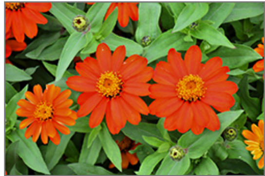
Zahara Fire Zinnia flowers

Zahara Fire Zinnia is recommended for the following landscape applications;