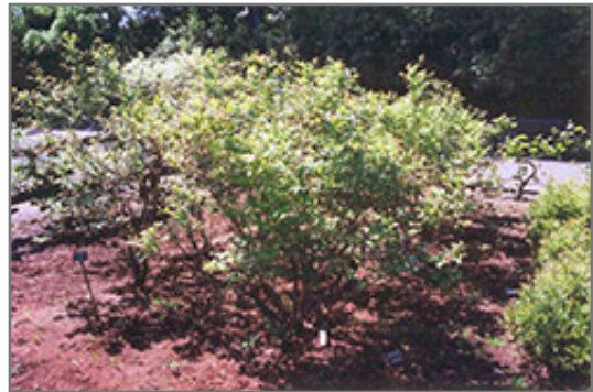
Northland Blueberry

This shrub does best in full sun to partial shade. It does best in average to evenly moist conditions, but will not tolerate standing water. It is very fussy about its soil conditions and must have sandy, acidic soils to ensure success, and is subject to chlorosis (yellowing) of the leaves in alkaline soils. It is quite intolerant of urban pollution, therefore inner city or urban streetside plantings are best avoided, and will benefit from being planted in a relatively sheltered location. Consider applying a thick mulch around the root zone in winter to protect it in exposed locations or colder microclimates. This is a selection of a native North American species.