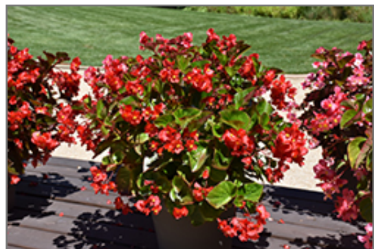
Whopper Red Green Leaf Begonia flowers