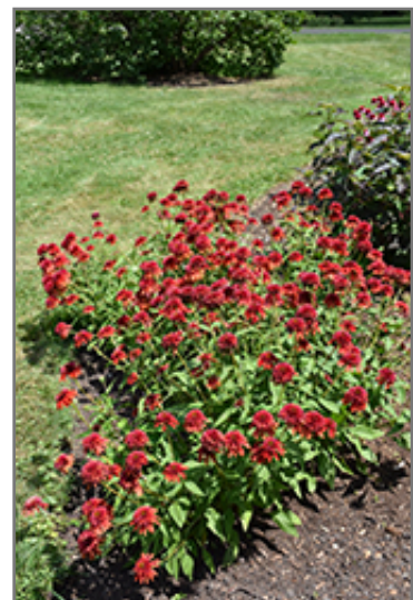
Double Scoop Orangeberry Coneflower in bloom