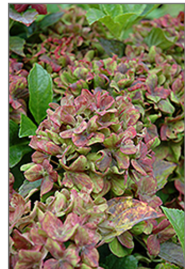
Pistachio Hydrangea flowers