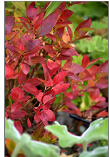
Jelly Bean Blueberry in fall

Jelly Bean Blueberry features dainty clusters of white bell-shaped flowers with shell pink overtones hanging below the branches in mid spring. It has red-variegated green foliage. The glossy oval leaves turn an outstanding red in the fall. It features an abundance of magnificent blue berries in mid summer.