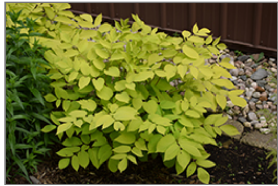
Sun King Japanese Spikenard