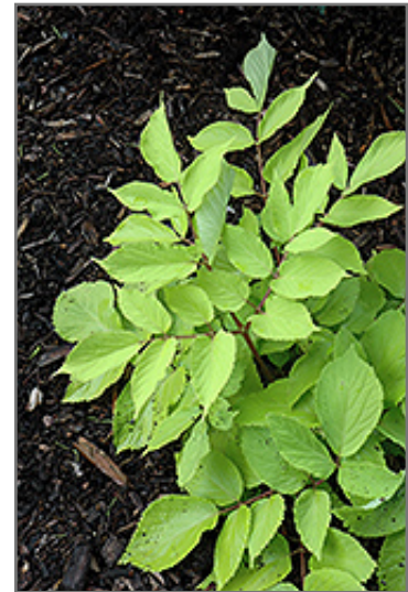
Sun King Japanese Spikenard foliage

This plant performs well in both full sun and full shade. It prefers to grow in average to moist conditions, and shouldn't be allowed to dry out. It is not particular as to soil type or pH. It is highly tolerant of urban pollution and will even thrive in inner city environments. This is a selected variety of a species not originally from North America.