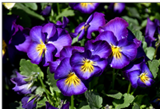
Halo Violet Pansy flowers