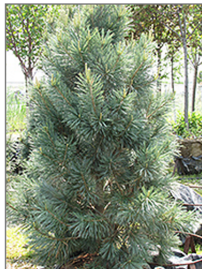
Vanderwolf's Pyramid Pine