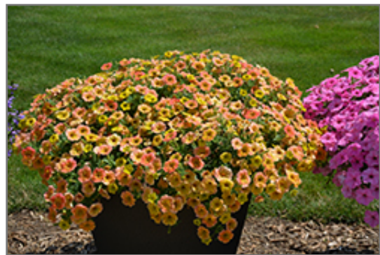
Supertunia Honey Petunia in bloom