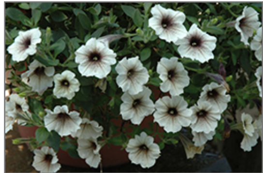
Supertunia Latte Petunia flowers