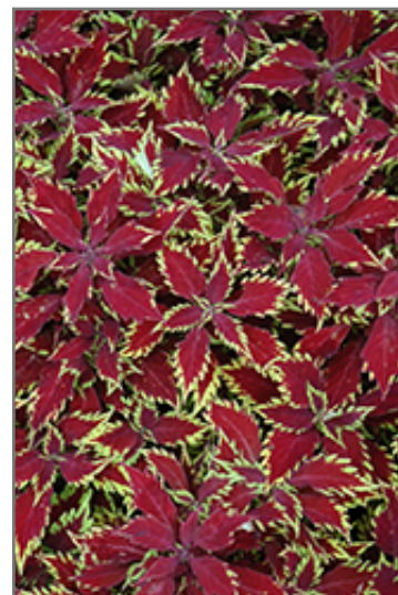
ColorBlaze Royale Apple Brandy Coleus foliage