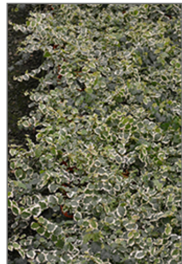
Variegated Creeping Fig in full