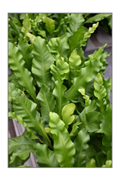
Bird's Nest Fern foliage

Bird's Nest Fern is primarily valued in the home for its cascading habit of growth. Its attractive large glossy narrow leaves remain light green in color with pointy black spines throughout the year.