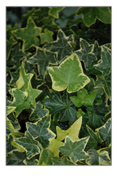
Gold Child Ivy foliage

When grown indoors, Gold Child Ivy can be expected to grow to be about 10 feet tall at maturity, with a spread of 3 feet. It grows at a medium rate, and under ideal conditions can be expected to live for approximately 30 years. This houseplant performs well in both bright or indirect sunlight and strong artificial light, and can therefore be situated in almost any well-lit room or location. It prefers to grow in average to moist soil. The surface of the soil shouldn't be allowed to dry out completely, and so you should expect to water this plant once and possibly even twice each week. Be aware that your particular watering schedule may vary depending on its location in the room, the pot size, plant size and other conditions; if in doubt, ask one of our experts in the store for advice. It is not particular as to soil pH, but grows best in rich soil. Contact the store for specific recommendations on pre-mixed potting soil for this plant. Be warned that parts of this plant are known to be toxic to humans and animals, so special care should be exercised if growing it around children and pets.