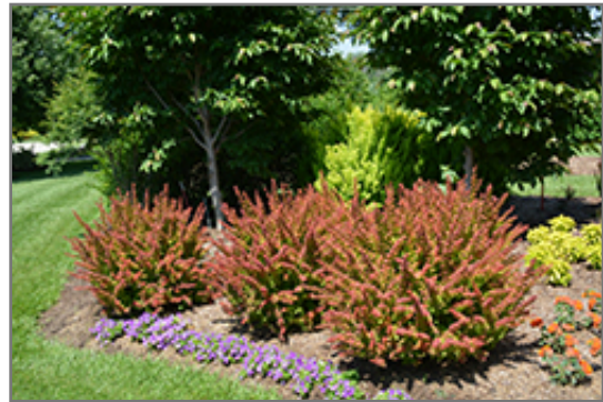
Sunjoy Tangelo Japanese Barberry

Sunjoy Tangelo Japanese Barberry is recommended for the following landscape applications;