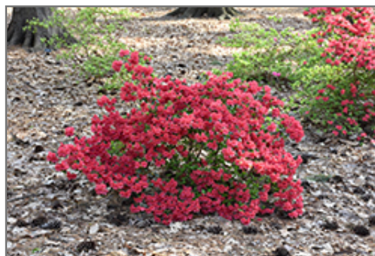
Girard's Crimson Azalea in bloom