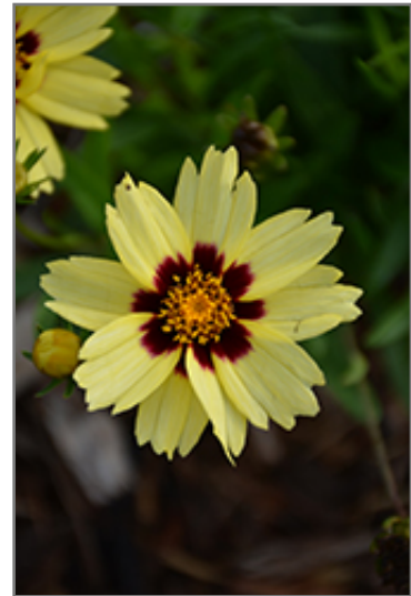
UpTick Cream and Red Tickseed flowers

UpTick Cream and Red Tickseed is recommended for the following landscape applications;