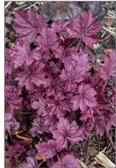
Wild Rose Coral Bells foliage