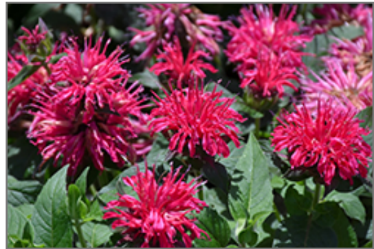
Balmy Rose Beebalm flowers