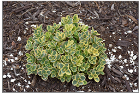
Lime Twister Stonecrop