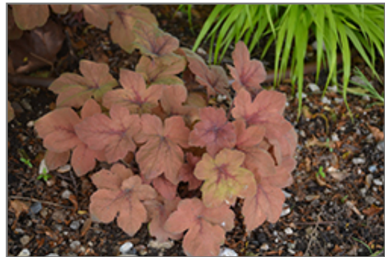
Pumpkin Spice Foamy Bells