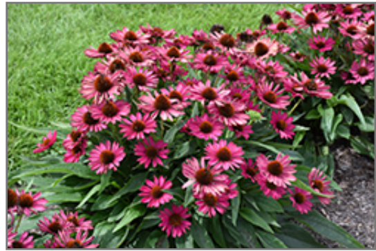
Kismet Raspberry Coneflower in bloom

Kismet Raspberry Coneflower will grow to be about 16 inches tall at maturity, with a spread of 24 inches. Its foliage tends to remain dense right to the ground, not requiring facer plants in front. It grows at a fast rate, and under ideal conditions can be expected to live for approximately 10 years. As an herbaceous perennial, this plant will usually die back to the crown each winter, and will regrow from the base each spring. Be careful not to disturb the crown in late winter when it may not be readily seen!