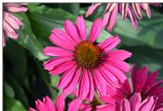
Kismet Raspberry Coneflower flowers