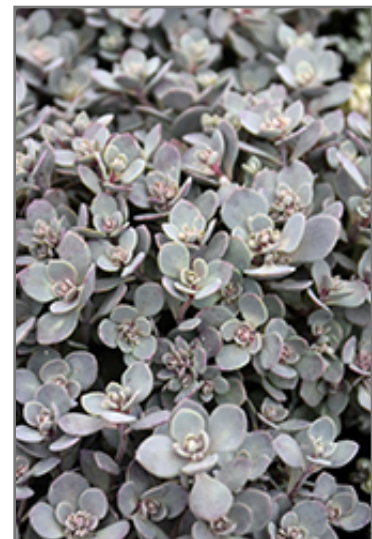
SunSparkler Blue Elf Sedoro foliage