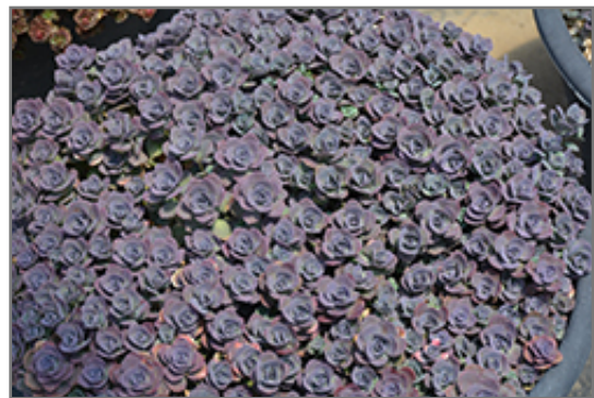
SunSparkler Blue Elf Sedoro